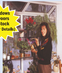
Green House Window Made in Canada

Windows & Doors in Stock (Ask for Details)