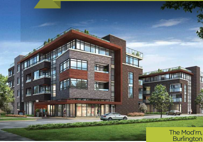
The Mod'rn, Burlington