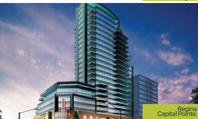
Regina Capital Pointe