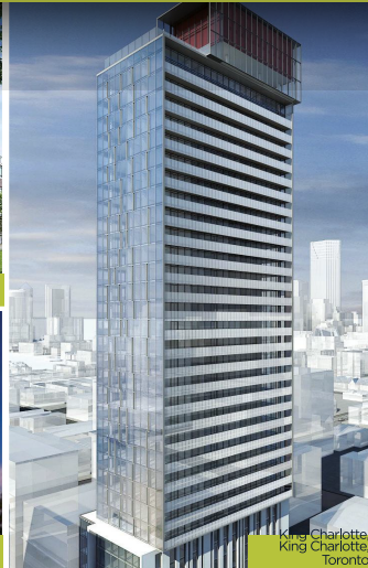
King Charlotte, King Charlotte, Toronto