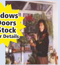
Green House Window Made in Canada

Windows & Doors in Stock ask for Details