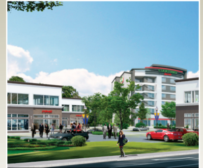
*DERRY BUSINESS CENTRE www.Derrybusinesscentre.com