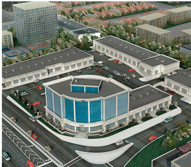
*BRAMPTON BUSINESS CENTRE www.Bramptonbusinesscentre.com